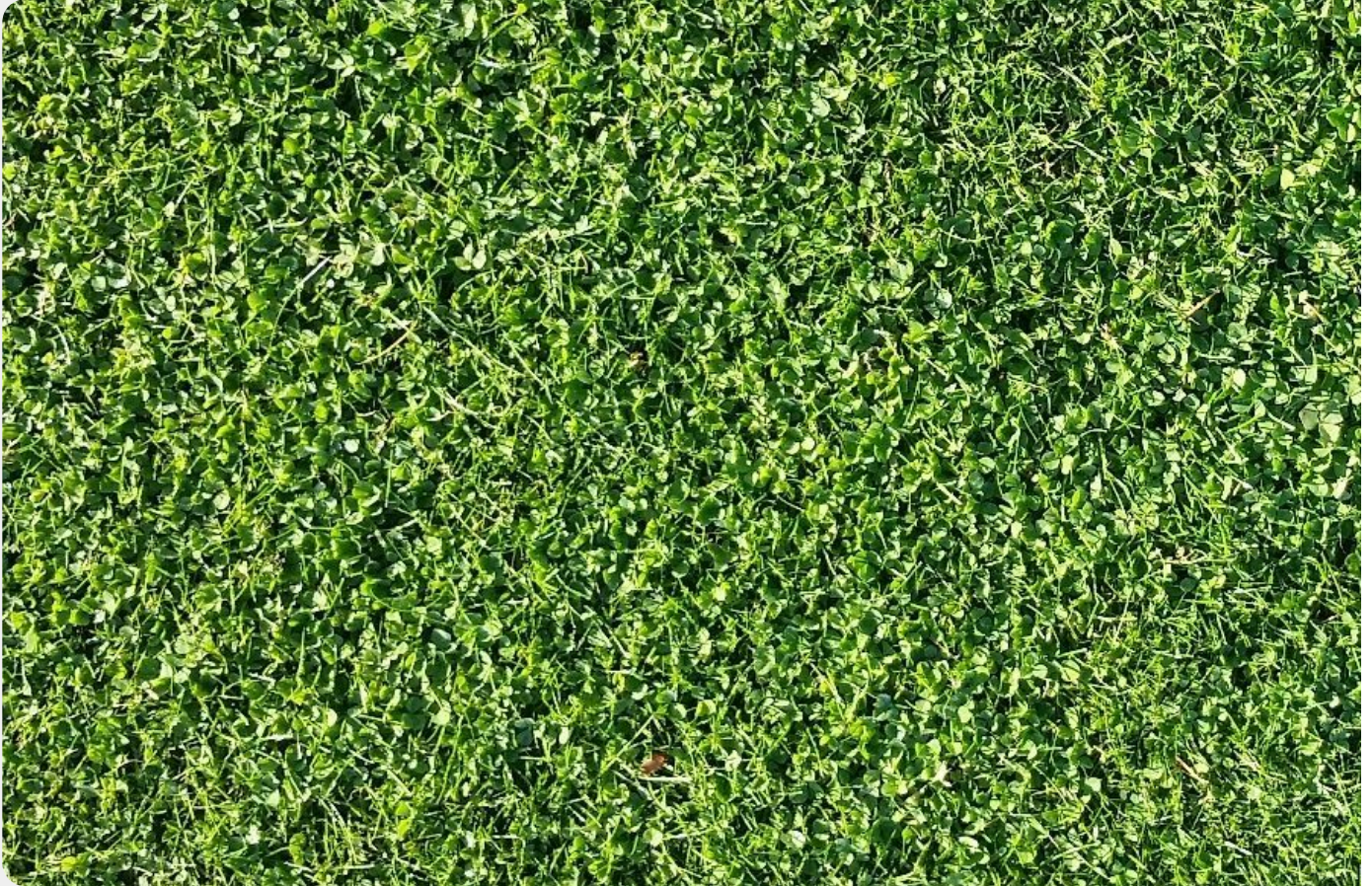
Successful overseeding of pure grass with Microclover®