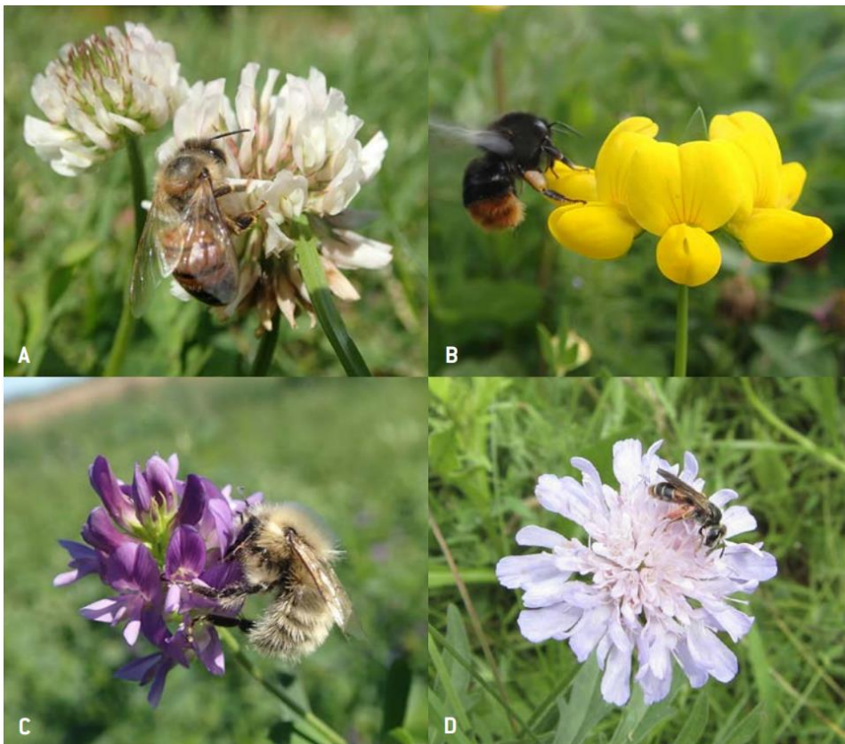
Four groups of bees, which differ in size and length of tongue, and thus food choice and function as pollinators: (a) Honey bee ( Apis mellifera), on white clover, (b) short-tongued bumble bee, here Red-tailed bumble bee ( Bombus lapidarius) on birdsfoot trefoil, (c) long-tongued bumble bee, here Common carder bumble bee ( Bombus pascuorum) on alfalfa, (d) solitary bee, here Large Scabious Mining bee ( Andrena hattorfiana) on field scabious.